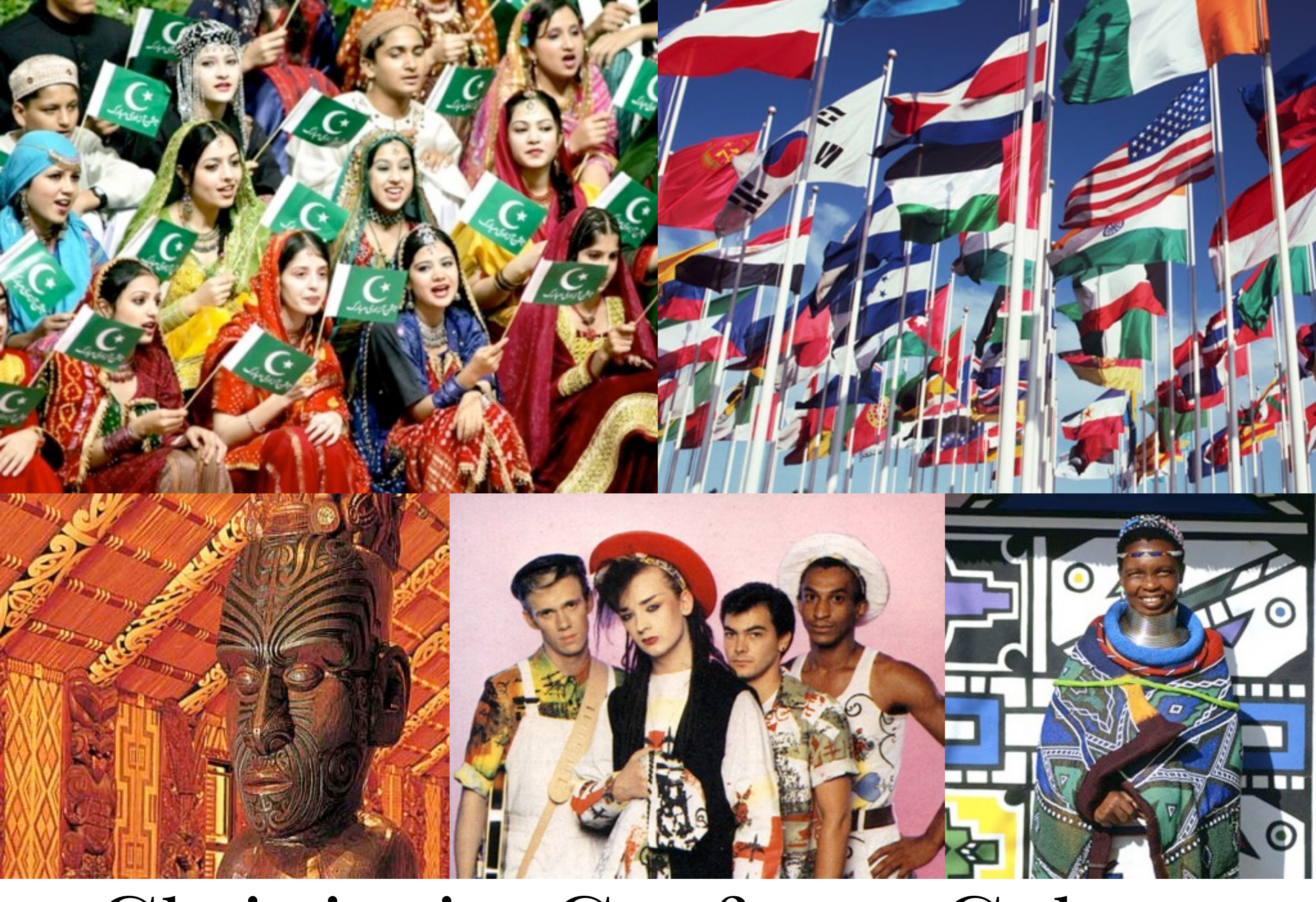
Christianity Confronts Culture